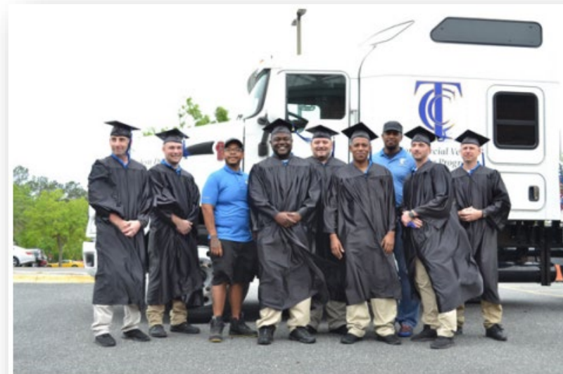
Inmates graduating from Tallahassee Community College's CDL program.

Vice President for Workforce Innovation Tallahassee Community College