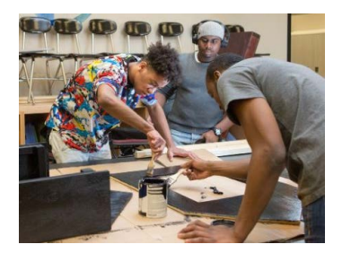
EducationNext: For CTE Success, Employer Involvement is Key

What does it mean for students to be "career ready"? It should mean they're prepared to enter the workforce with the knowledge and skills they need to thrive, ideally in fields that pay enough to support a family. But too often career-preparation programs fail to live up to their name.